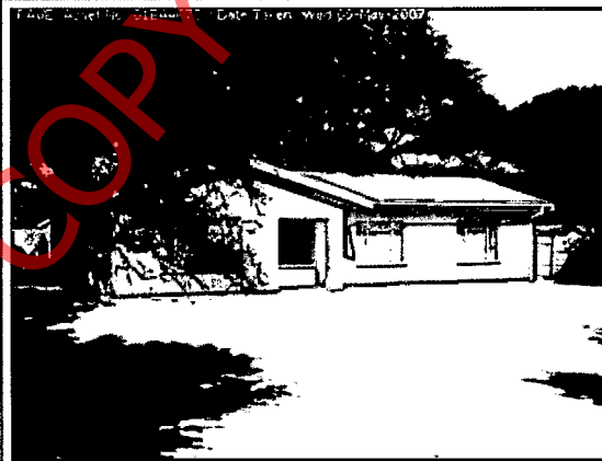
Asset: 01EA467S - View from : 45° Left Date: 09-May-2007 File No:10023570 (4/9)