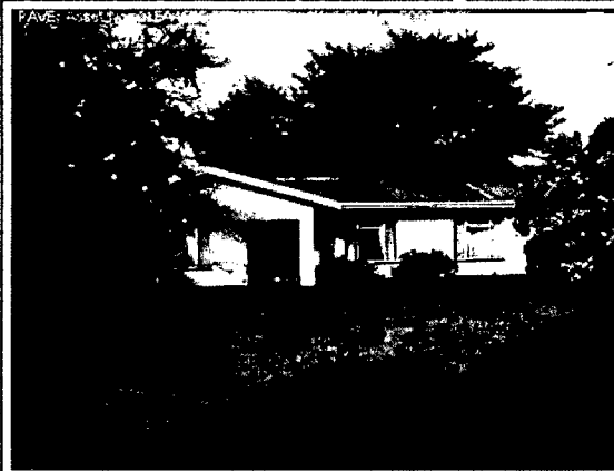
Asset:01EA467S - View from :Front Date: 21-May-2003 File No:10012588 (9/9)