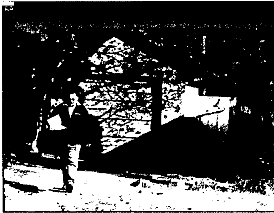
Asset:01EA467S_01 - View from :Front Date: 14-Jun-2006 File No:10017548 (7/9)