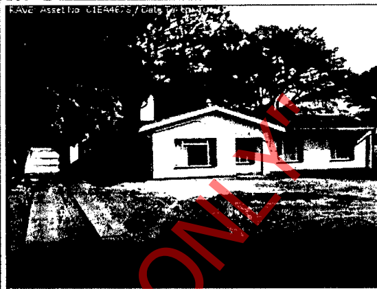
Asset: 01EA467S - View from : Front Date: 15-Sep-2009 File No:10035613 (2/9)