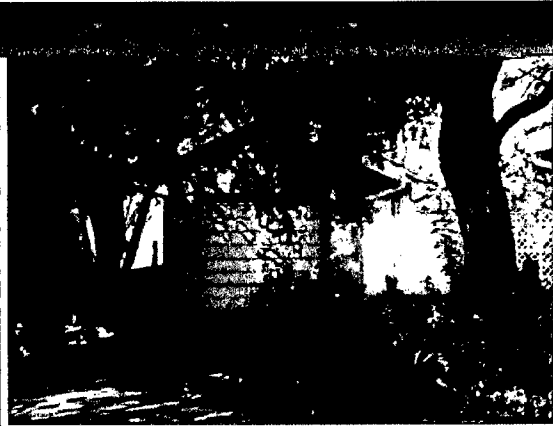
Asset:01EA467S_01 - View from :Front Date: 21-May-2003 File No:10012589 (8/9)