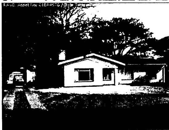
Asset: 01EA467S - View from : Front Date: 07-Sep-2010 File No:10040773 (1/9)