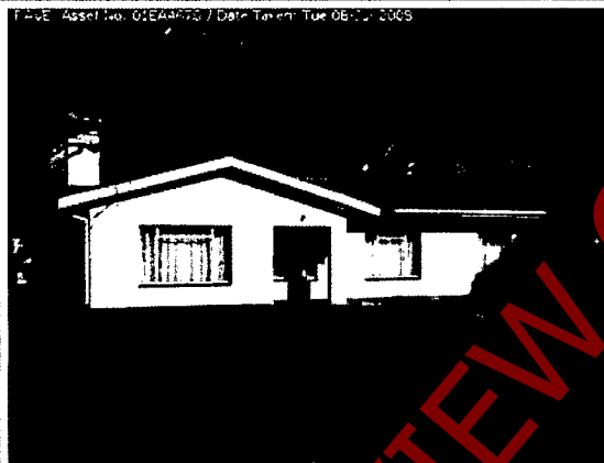
Asset: 01EA467S - View from : Front Date: 08-Jul-2008 File No:10028845 (3/9)