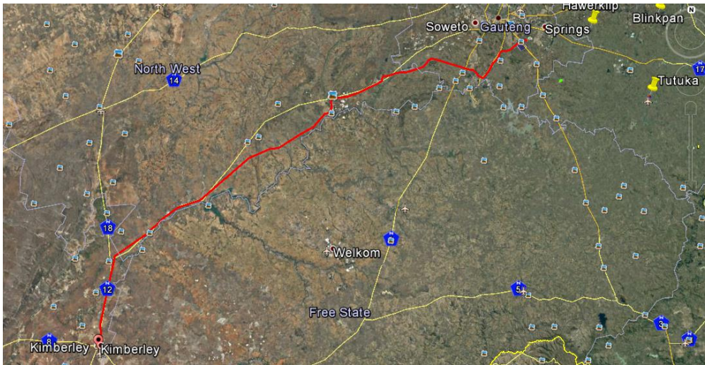
Figure 3: Routing from Tambo Springs to Kimberly Yard

The focus of this simulation is the Arrival/Departure yard (Exchange Yard) and the rail infrastructure between Tambo Springs and Kimberly Yard as shown in figure 3 below.