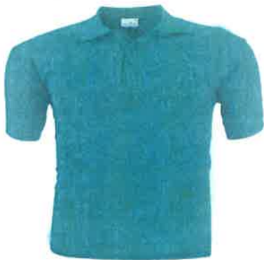
Picture of design of golf shirts below