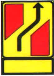
TIN 11.3 TSG+, Size 1600 x 1200 including stand