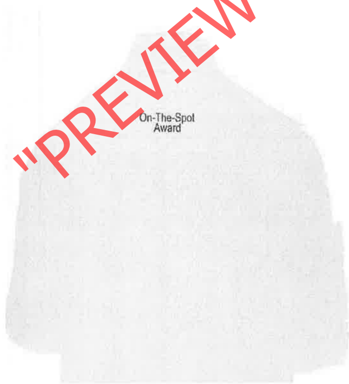
Male and female golf shirts