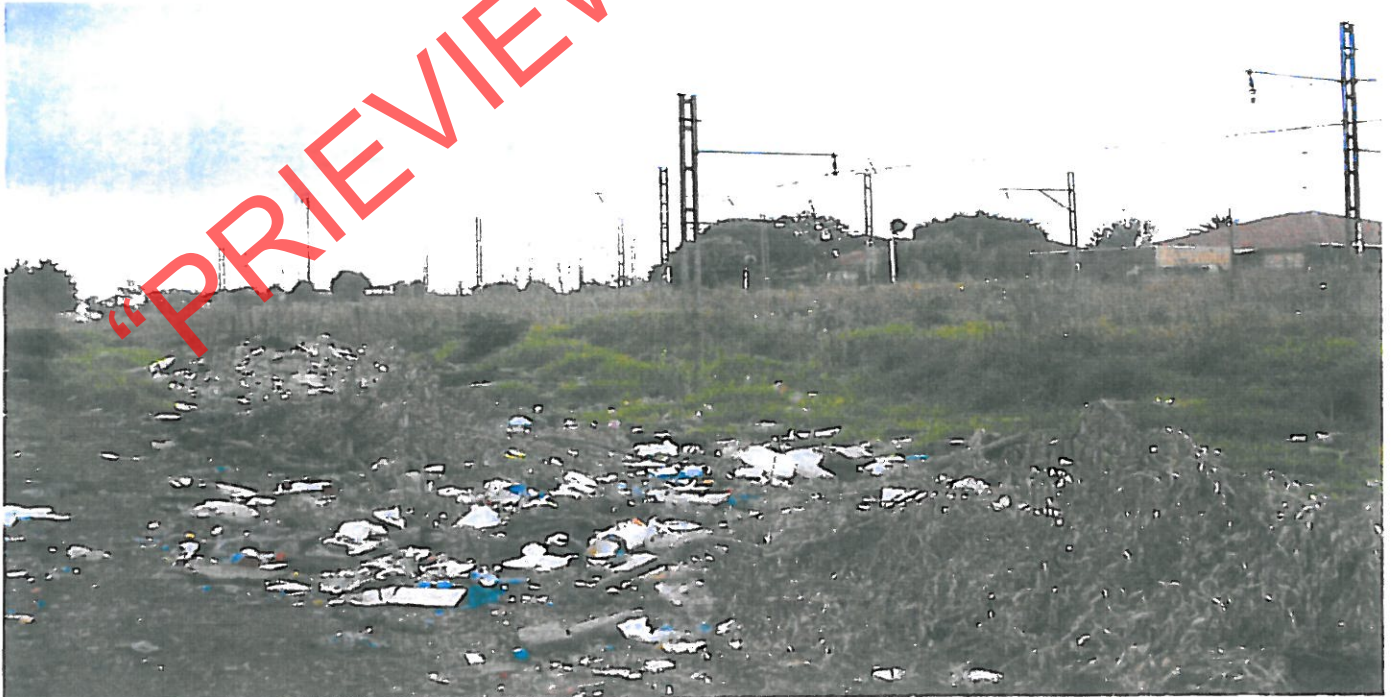
Rail reserves turned to a dumping site