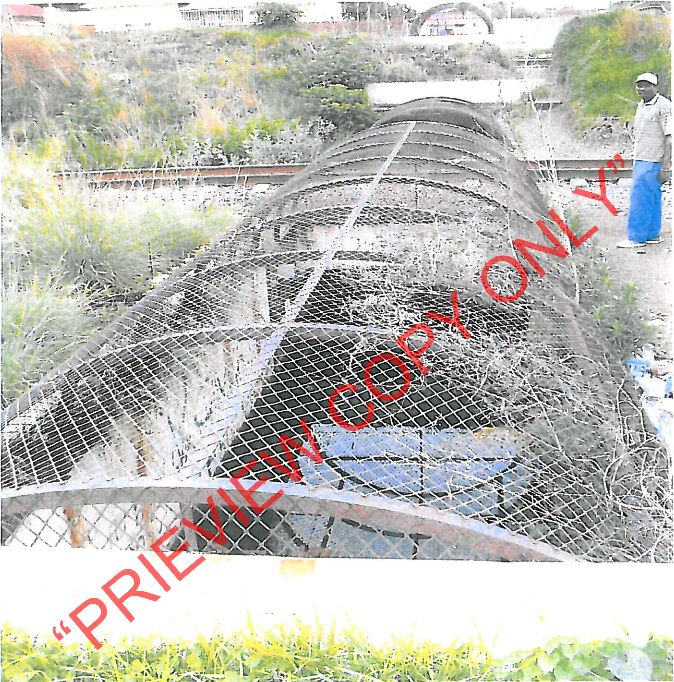
Pedestrian Crossing's overall length, view from 8 th Street