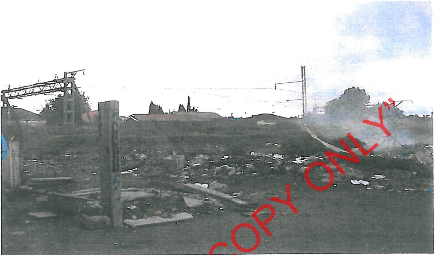
Destroyed fencing and burning of dumping on the rail reserve