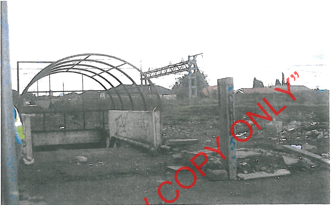
Pedestrian Subway's 8 th Street entrance. Protection in form of slabs fencing has been destroyed in order to by-pass the subway