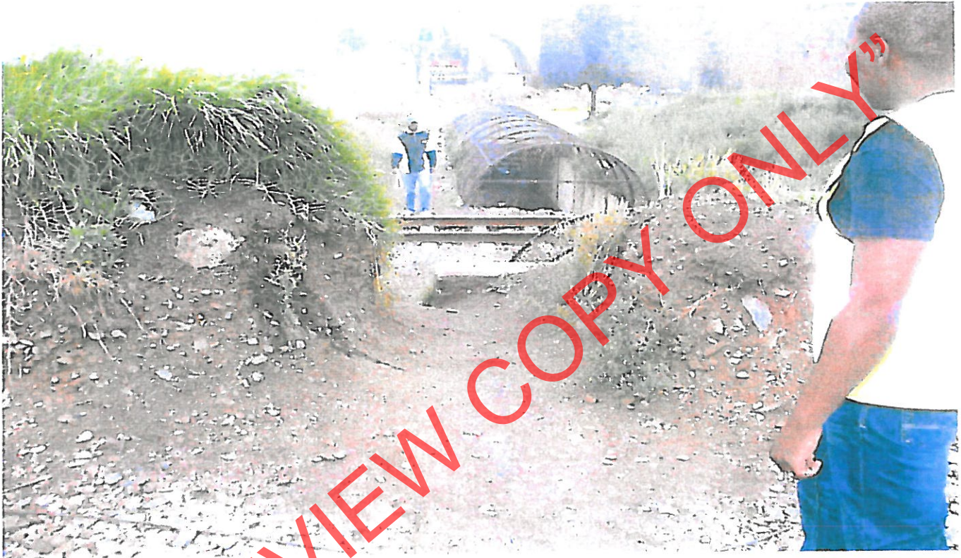
Person crossing railway lines just next to the pedestrian subway from Springs CBD (8 th Street) to Frederick Street (Springs Ext)