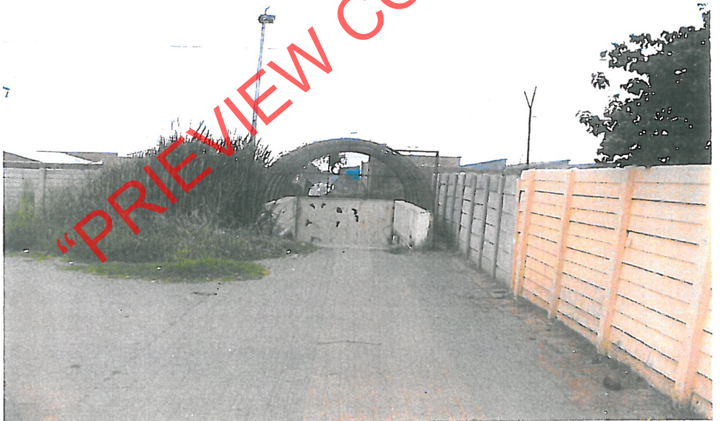
Frederick Street Entrance (Check long vegetation next to it)