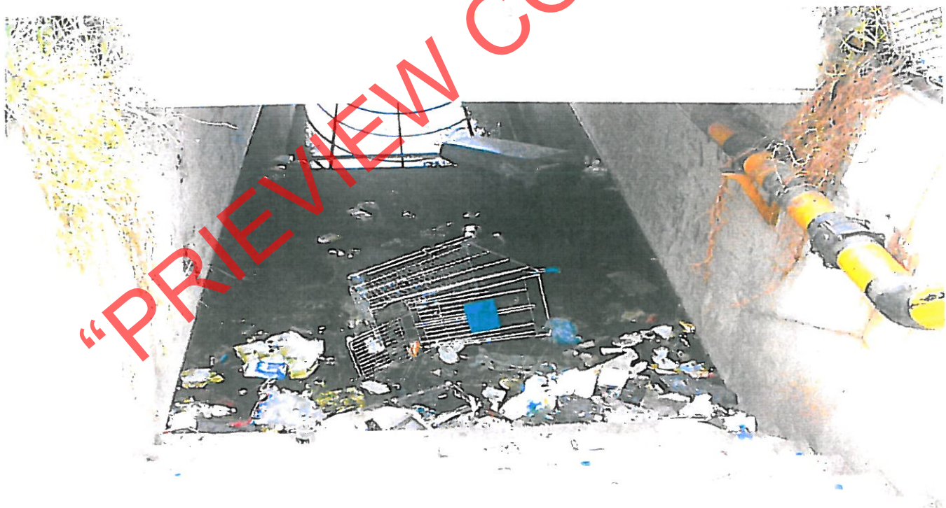
Entrance or Exit on the 8 th Street Side of the pedestrian subway. Check green water with rubbish inside the subway!