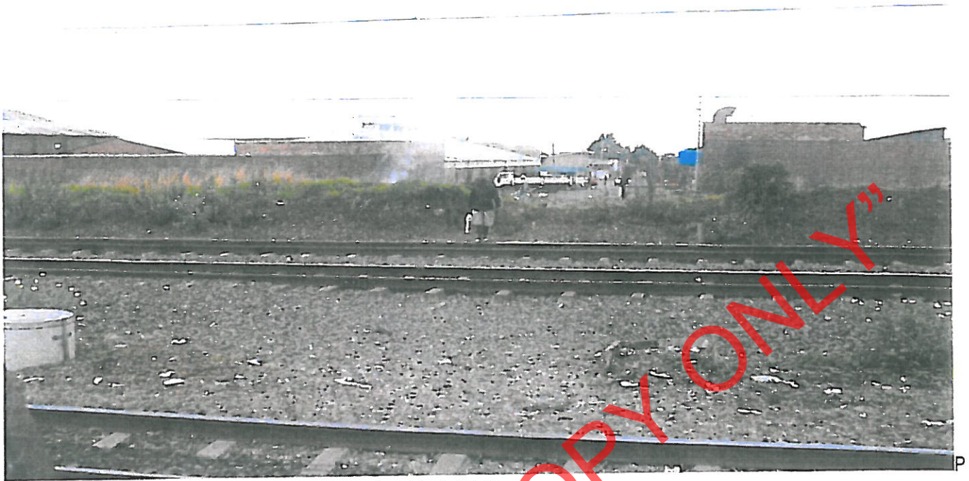
Person crossing rails from CBD to Springs Extension, Frederick Street